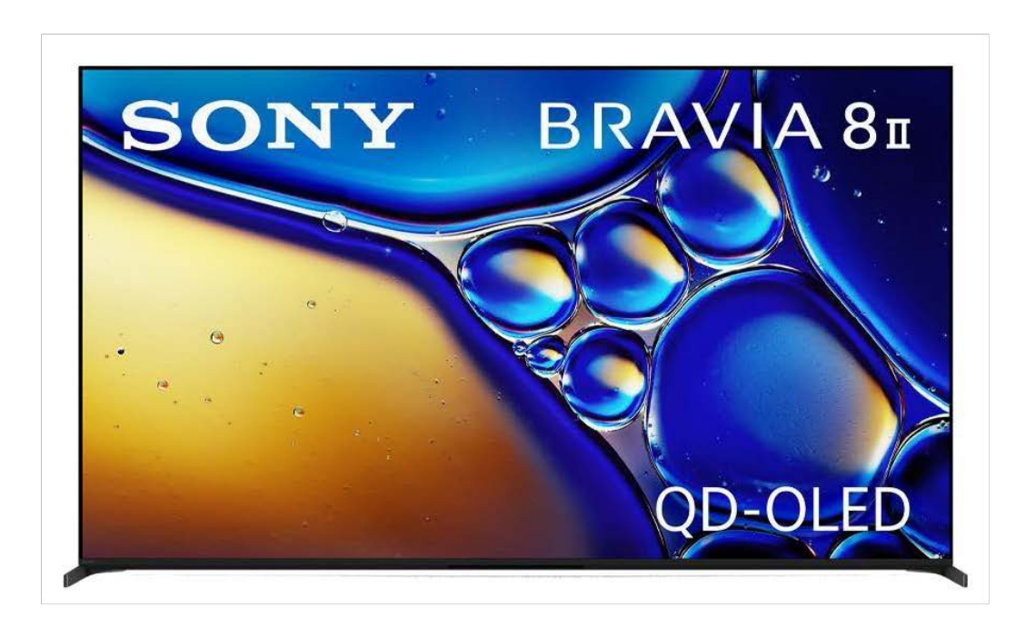
Page 7 of 11 Sony BRAVIA 8 M2, model # 65XR80M2 QD OLED TV.pdf technical specifications