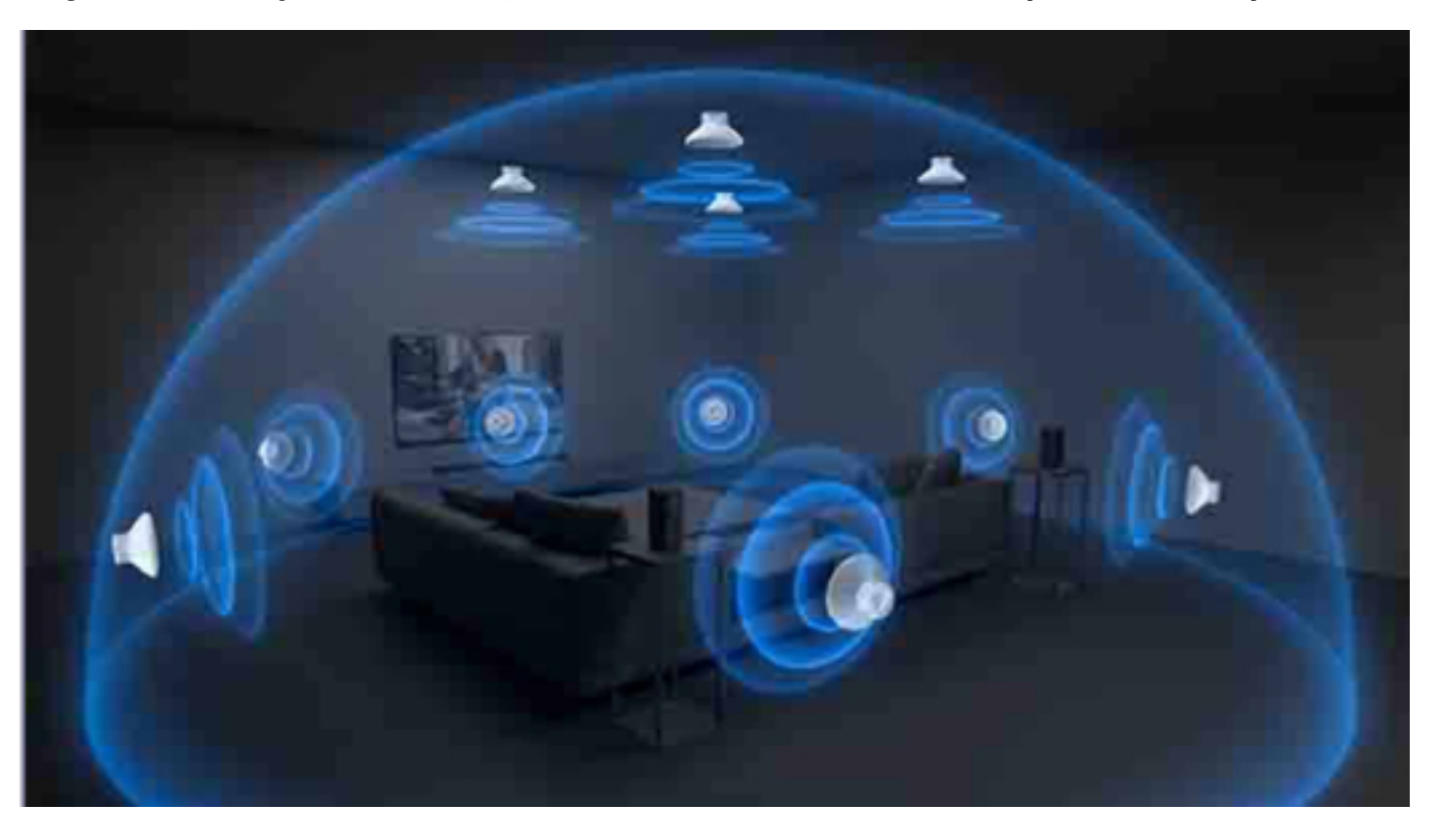
Page 8 of 11 Sony BRAVIA 8 M2, model # 65XR80M2 QD OLED TV.pdf technical specifications